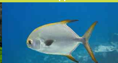
Indo Pacific Permit